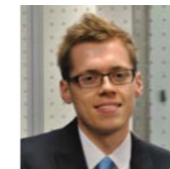
Jack Sullivan Investment Consulting

LCP's application process was easily one of the most streamlined and straightforward. It involved just a simple application form and one trip for a morning assessment centre.